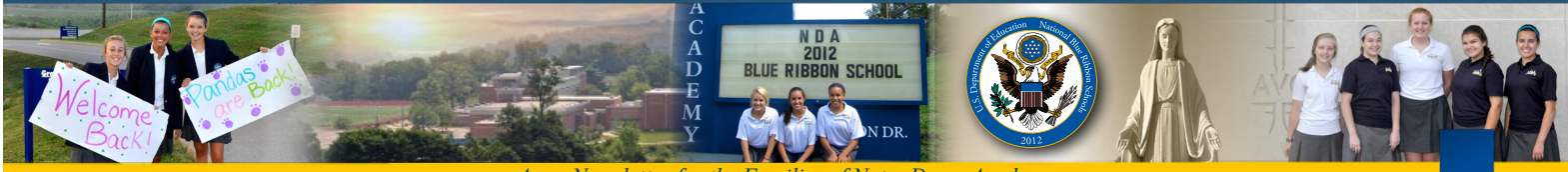
An e-Newsletter for the Families of Notre Dame Academy